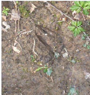
Fallow deer track

of logs. After their subsequent disappearance, we learnt during a conversation with local children that they had recently added a badger skull to their treasured collection of wildlife remains, so they had gone to a good home.