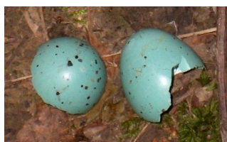
Song thrush eggs

Early spring is the only other time the male pheasants lose their inhibitions, strutting confidently between the trees, pausing intermittently to emit an ear-splitting squawk accompanied by a strange little jump and flapping of wings. With his iridescent green head plumage, prominent feather 'ears', cherry red eye patches, white collar and a metallic sheen to his copper and black patterned body, how could any female resist the invitation to become a member of his harem?