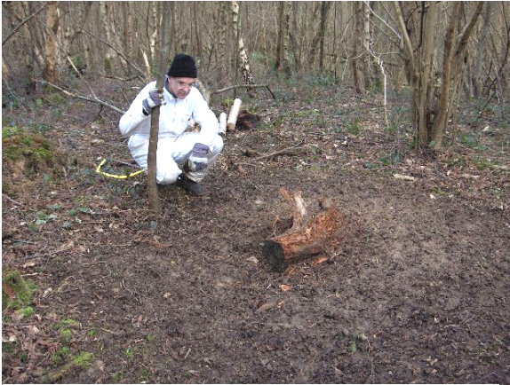
The rutting ring path

the rutting season in July and August, when the male walks round and round a tree chasing a female, eventually forming a 'rutting ring path'.