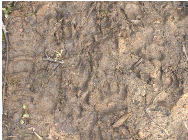
A busy stretch of muddy track used by many, including badgers. The characteristic large, wide, interdigital pad behind the toes is clearly visible.

there is more than one long established sett comprising over twenty holes, but also because they habitually cover quite a distance during their nightly foraging expeditions, over the years wearing a pattern of very well defined pathways, criss-crossing the entire wood. We collected some excellent tips and informative literature from the Kent Badger Groups whilst at the County Show in July detailing exactly how to determine the activities of our native