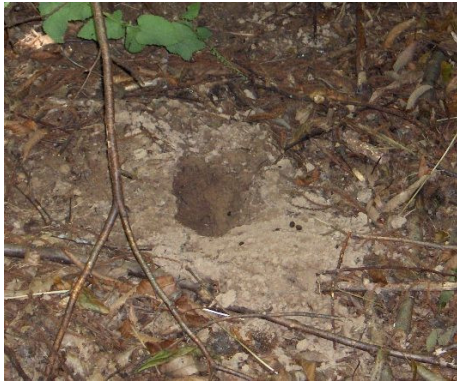
A newly dug rabbit hole, measuring 15cm across, under a chestnut tree on the northern boundary. The occupant helpfully left several small, round droppings in the ejected soil

Over a period of eighteen months though, these encounters hardly seem to verify my earlier statement that 'Long Wood' is teeming with wildlife'; for that I have to rely not on actual sightings to confirm the animals presence, but the evidence they leave as they move about their territory carrying out their normal routines. Tracks and trails, footprints, dung, nibbling, bodies, bones, nests and dens litter the entire thirteen and a half acres that we own. Entrances to homes vary from solitary holes just over a centimetre wide to