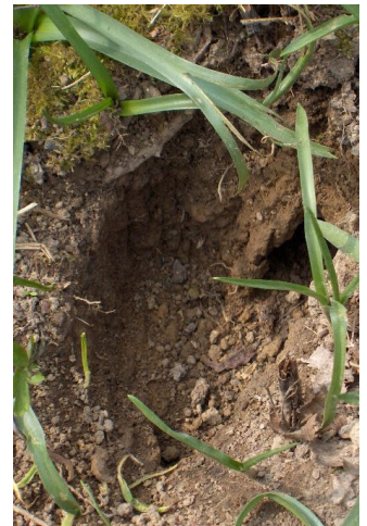
A snuffle hole where a badger has been digging for worms. There are deep claw marks on the sides.

More hidden wildlife.....a rabbit, a toad and a great crested newt