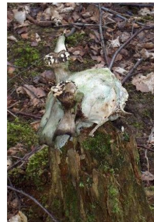
Skull of male roe deer

The next most substantial body of evidence is left by the roe and fallow deer whose tracks can be traced running generally from east to west through Long Wood, milling around the perimeter of the pond and crossing the stream both into and from the wood adjoining our land. The animals' presence appears to peak and wane throughout the year so that at times there are numerous indicators of their activities but at others, very few. Fresh trails and droppings will suddenly appear, the tips of young tree growth and plants, especially pendulous sedge, are torn off, bark bitten, and patches of the woodland floor become flattened with hairs left amongst the leaf litter or stuck to the soil. At the end of April extensive swathes of bluebells along the western boundary were crushed - the odour of deer overpowering the subtle scent of the flowers in the vicinity.