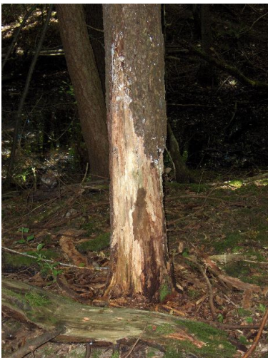
A scratching post close to the pond with vertical gouges all the way round

of the wildlife that either resides in or visits Long Wood. Meanwhile I have made a start on deciphering the enormous volume of information, realising in the process that the more I discover, the more fascinating the environment of our woodland becomes.