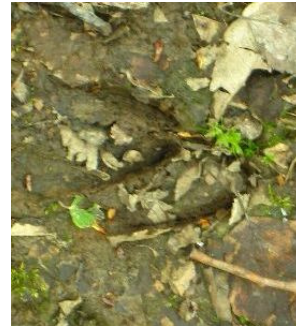
Roe deer track

The next most substantial body of evidence is left by the roe and fallow deer whose tracks can be traced running generally from east to west through Long Wood, milling around the perimeter of the pond and crossing the stream both into and from the wood adjoining our land. The animals' presence appears to peak and wane throughout the year so that at times there are numerous indicators of their activities but at others, very few. Fresh trails and droppings will suddenly appear, the tips of young tree growth and plants, especially pendulous sedge, are torn off, bark bitten, and patches of the woodland floor become flattened with hairs left amongst the leaf litter or stuck to the soil. At the end of April extensive swathes of bluebells along the western boundary were crushed - the odour of deer overpowering the subtle scent of the flowers in the vicinity.