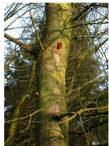
A woodpecker has pecked a circular nest hole in standing dead chestnut

munching our sandwiches, to witness a greater spotted woodpecker drumming away at the trunk of a Douglas fir. During our wanderings in the wood, we have also caught glimpses of grass snakes around 'Hazel Corner' as they have slithered off the track into the brambles and seen flashes of the rich, chestnut brown coats of bank voles darting through the wild flowers and dewberries.