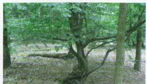
Bear Wood, Essex About 3 1/2 acres, £39,000

Latch Wood is a classic ancient woodland with some fine mature oaks, along with hornbeam, hazel, holly, hawthorn and birch and shows off a wonderful display of bluebells in spring.