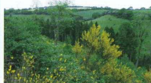
Trelawne Wood, Cornwall About 4 acres, £25,000

Wades Wood is situated within the outstanding scenery of the North York Moors National Park and is a mixed woodland of almost 4 acres which offers a peaceful setting to escape the rigours of hectic modern living.