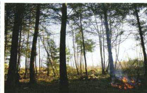
Wades Wood, North Yorkshire About 4 acres, £39,000

Wades Wood is situated within the outstanding scenery of the North York Moors National Park and is a mixed woodland of almost 4 acres which offers a peaceful setting to escape the rigours of hectic modern living.