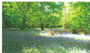
Latch Wood, Kent 7 1/2 acres, £55,000

Trelawne Wood lies along the eastern arm of a large, T-shaped area of woodland which occupies a secluded valley, not far from the south Cornish coast.